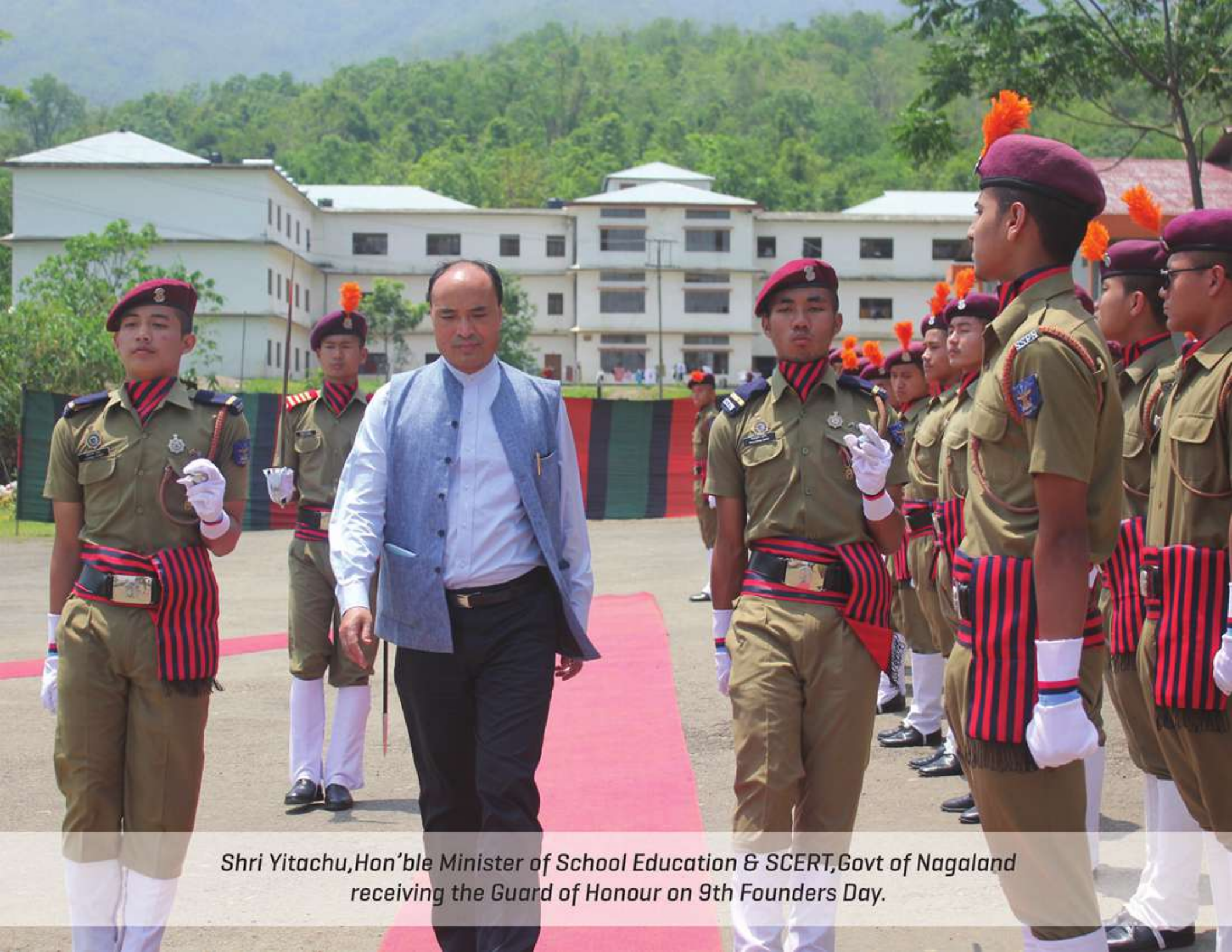
Shri Yitachu, Hon'ble Minister of School Education & SCERT, Govt of Nagaland receiving the Guard of Honour on 9th Founders Day.